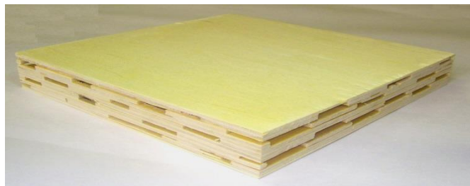
Fig. 1. Plywood cellular plate from an interline interval

A new thermal insulation material is a plywood cellular plate made of veneer (Fig. 1) [4, 8].